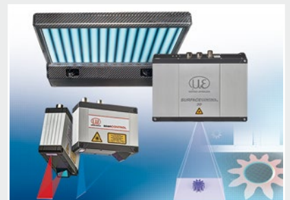
3D measurement technology for dimensional testing and surface inspection