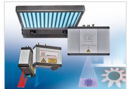
3D measurement technology for dimensional testing and surface inspection