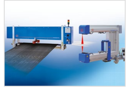
Measuring and inspection systems for metal strips, plastics and rubber