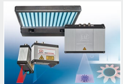
3D measurement technology for dimensional testing and surface inspection