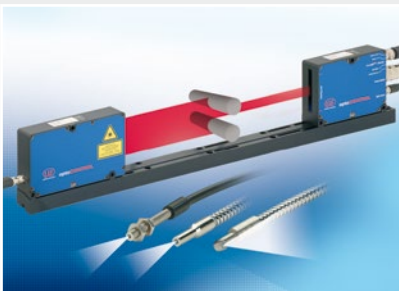
Optical micrometers and fiber optics, measuring and test amplifiers